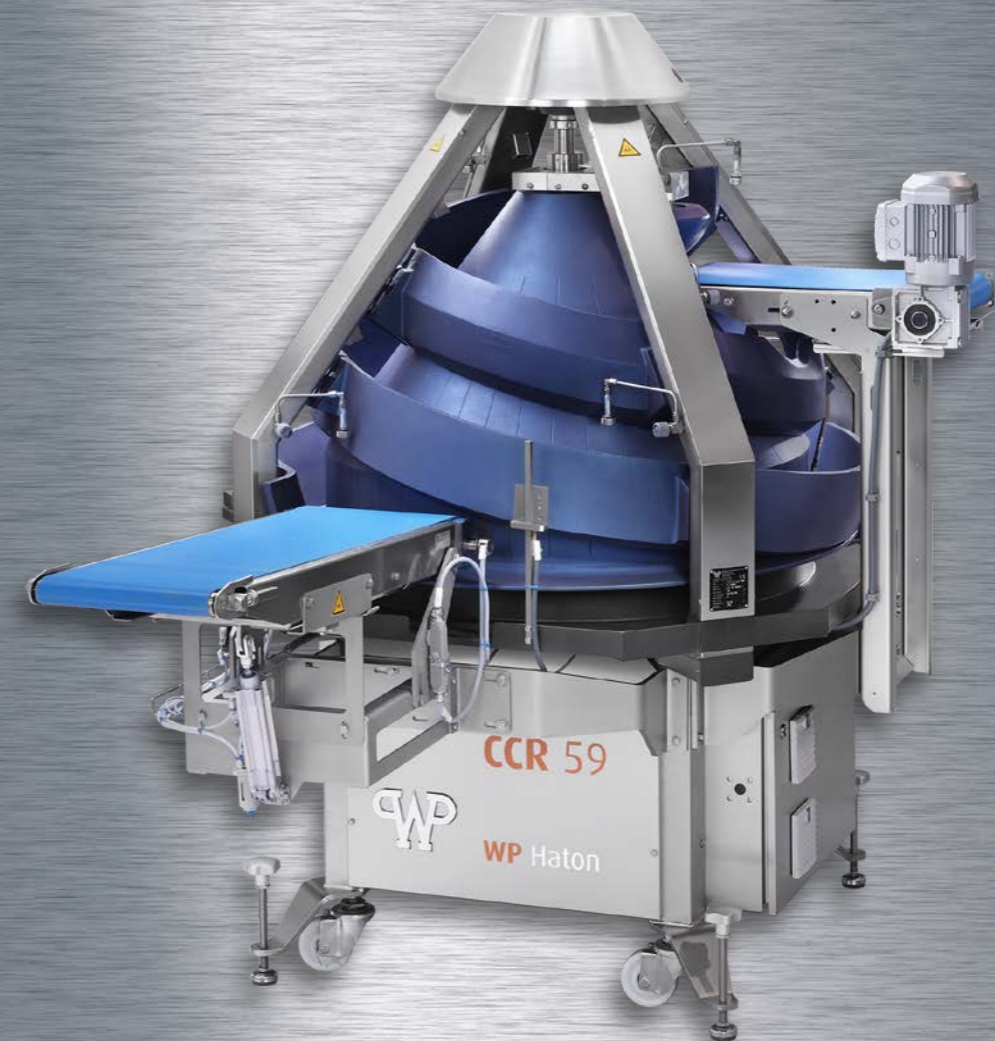
CCR 59 Conical Rounder

Industrieterrein 13 // 5981 NK Panningen // Netherlands // Phone +31 77307-1860 // Fax +31 77307-5148 // info@wp-haton.com // www.wp-haton.com