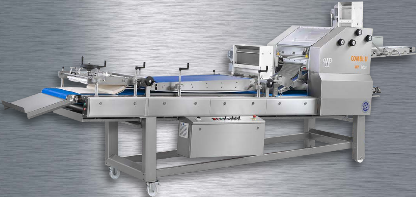
COMBI U Long Moulder

WP HATON BV Industrieterrein 13 // 5981 NK Panningen // Netherlands // Phone +31 77307-1860 // Fax +31 77307-5148 // info@wp-haton.com // www.wp-haton.com