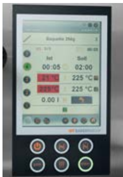
// WP NAVIGO II PROFICONTROL plus